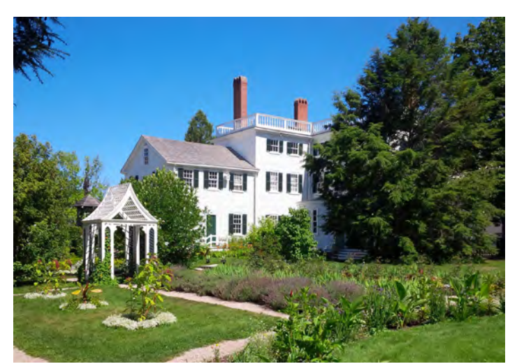
Goodwin Mansion and gardens.