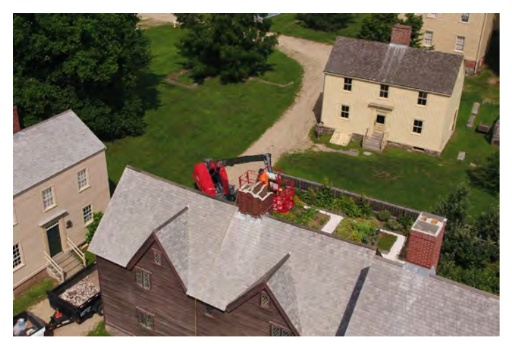
The painstaking work of removing the Sherburne House chimney that was built in the 1960s and had deteriorated beyond the point of repair.