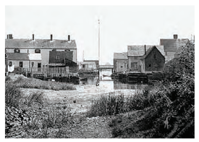
The orientation film usually shown in the TYCO Visitors Center puts Strawbery Banke into the context of Portsmouth's 300-year history.

Visit the Puddle Dock neighborhood, the historic houses, or the museum's gardens and historic landscapes by logging in to strawberybanke.org/visit.cfm