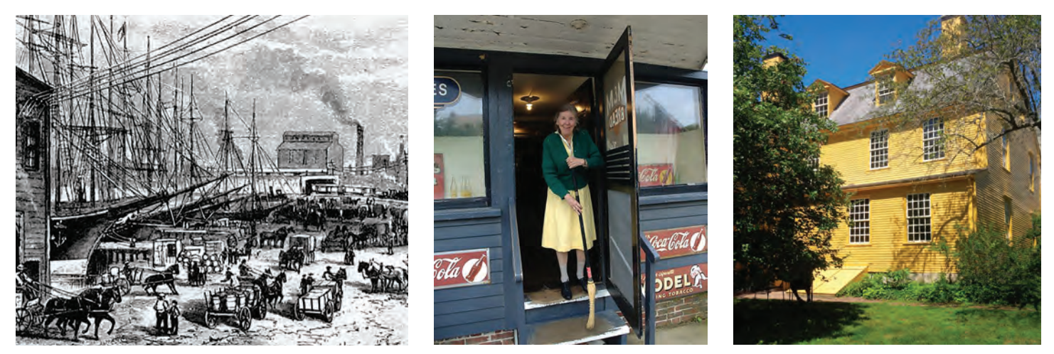
Puddle Dock Adventures

The Strawbery Banke Education Department uses the Virtual Classroom to prepare school and homeschool groups for their field trip visits (the museum welcomes 10,000 schoolchildren each year!). Teacher's guides connect the museum experiences and workshops to the state curriculum standards, while activity sheets provide lessons useful for at-home classrooms as well as in-school and on-site. Discover lesson-planning materials, primary documents, and interactive exercises. Some of the highlights include: