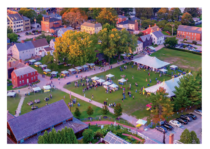
Strawbery Banke Signature Events — Sample the many special events at Strawbery Banke with a 'flyover' video produced by David Murray/ClearEyePhoto.com.