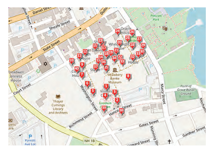
Historic Houses Sidewalk Tour — A virtual tour of Strawbery Banke Museum created by the UNH Geospatial Lab, for exploring the neighborhood from home or the sidewalk.

Listen to the Landscape — Discover images that illustrate the rich history of this waterfront neighborhood accompanied by the voices, sights and sounds from the past.